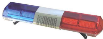
top mounted emergency lights with siren (various colors and sounds)