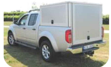
hardtop with foldable panels