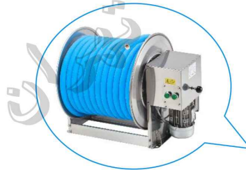
Hose reel with electric drive

Customized for decontamination with full water/foam throwing capacity. Attachable foam thrower and additional switchable chemical reservoirs for quick change of additives. Available with extended hose capacity on electric or manual driven reel.