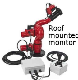
Roof mounted monitor