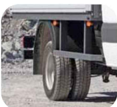
dual tires - rear